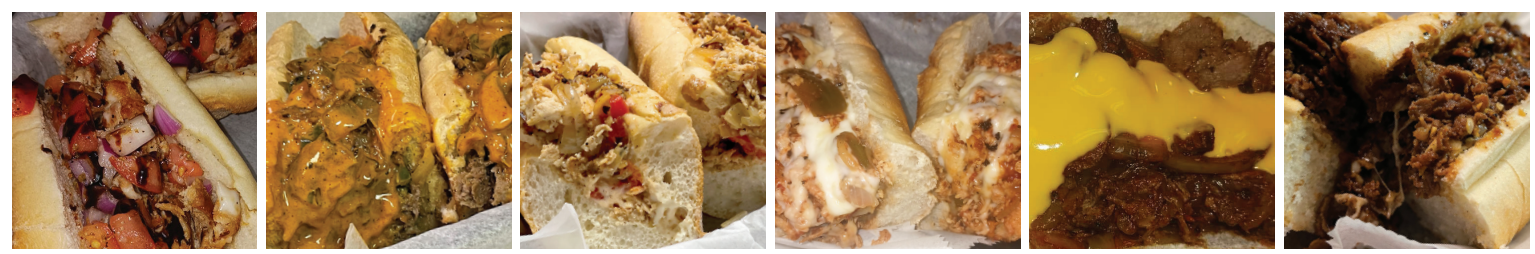
BRUSCHETTA CHICKEN CHIPOTLE CHEDDAR ZIO'S CHICKEN CHICKEN CACCIATORE PHILLY SUPREME ASIAN GARLIC