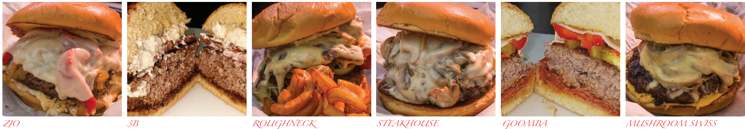
ZIO 3B ROUGHNECK STEAKHOUSE GOOMBA MUSHROOM SWISS