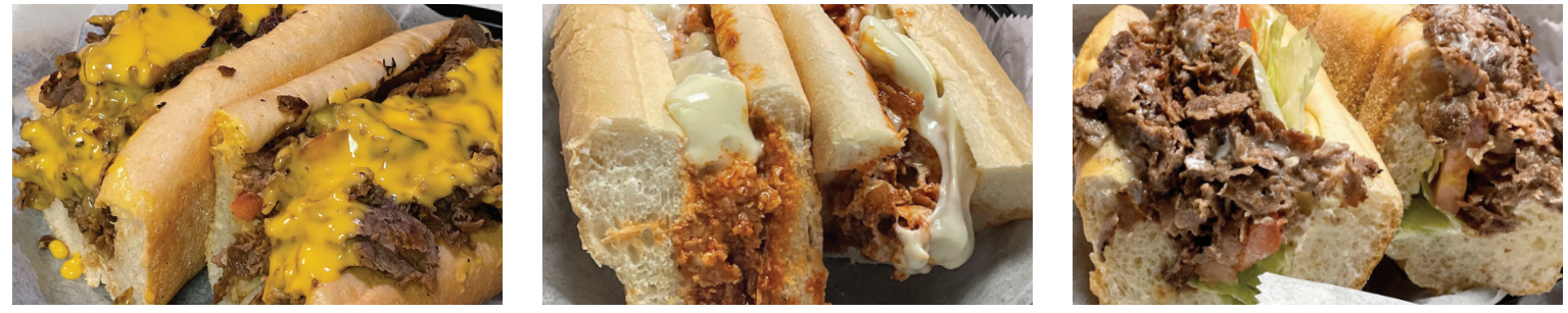
MAC DADDY CHICKEN WING CHEESESTEAK CALIFORNIA CHEESESTEAK