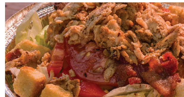
ZIO'S CHICKEN BLT SALAD